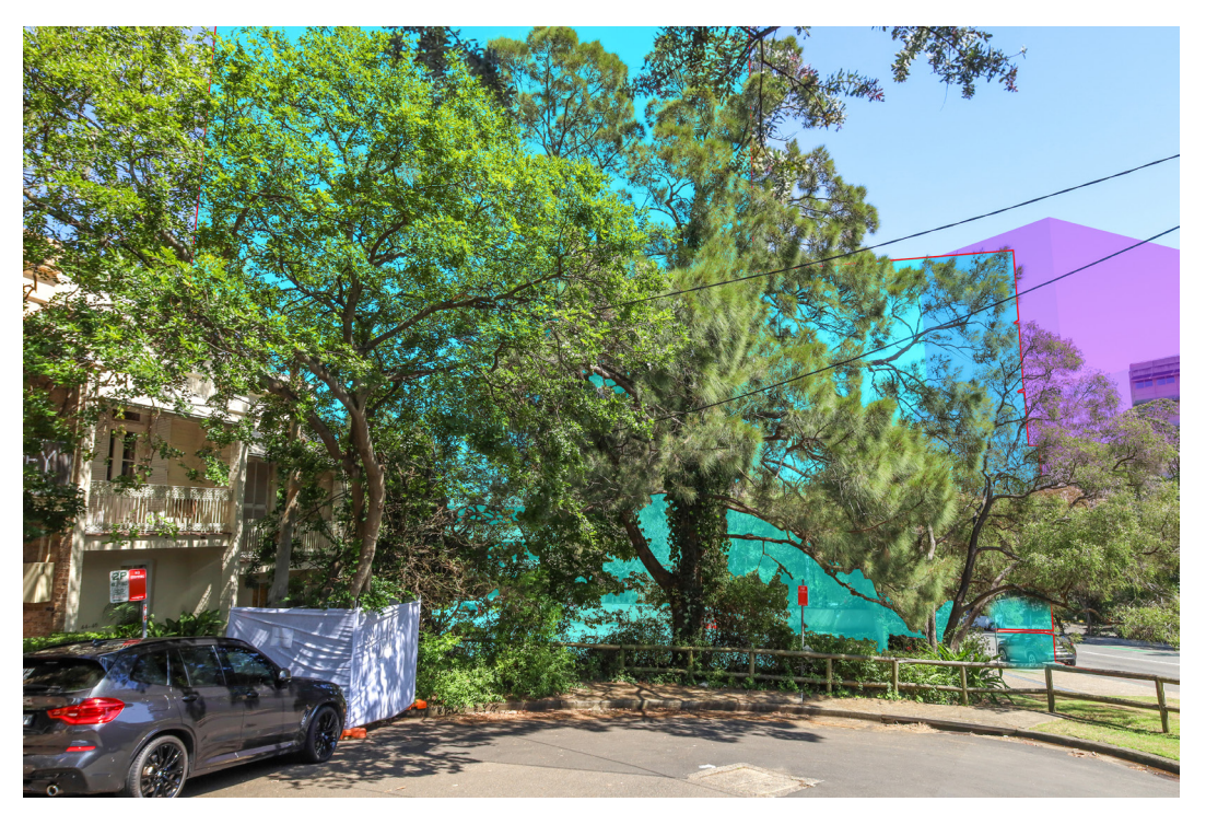
P3_49 IMG_2043 d.jpg