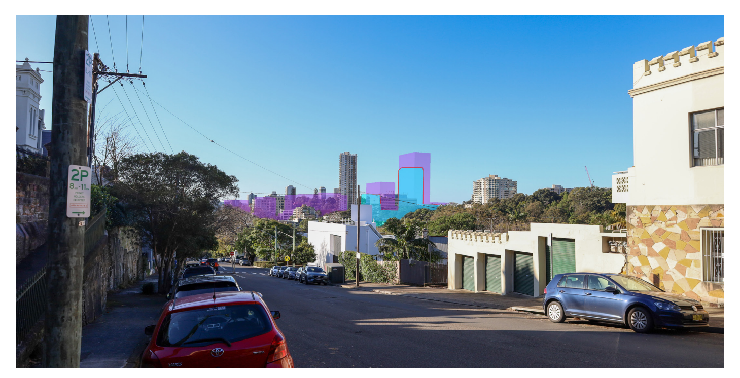
Camera 04 v2 IMG_9393 d.jpg