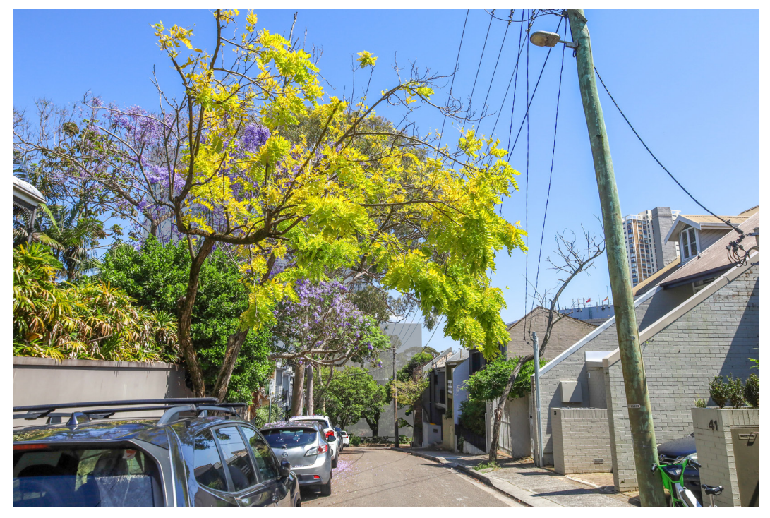
P3_45 IMG_1986 e.jpg

Photomontage of permitted development envelope.