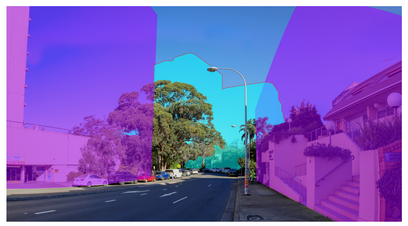
P3_07 IMG_9462-Pano d.jpg