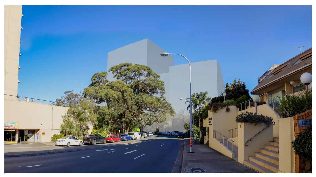
P3_07 IMG_9462-Pano e.jpg

Photomontage of permitted development envelope.