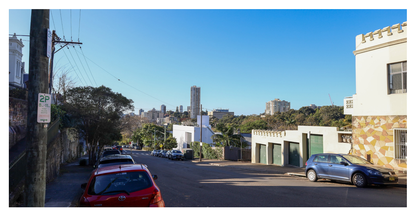
Camera 04 v2 IMG_9393 a.jpg

Existing site photo - static and dynamic, public external viewpoint. Distance to subject site boundary: 458m. Distance to centre of main residential tower: 485m RL: +42.7